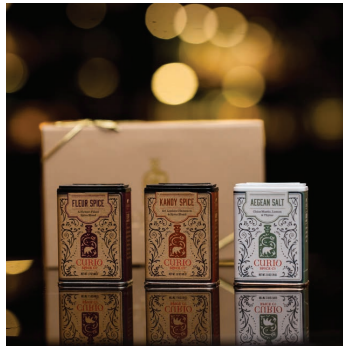
Chef Collection & Supec Curio Spices