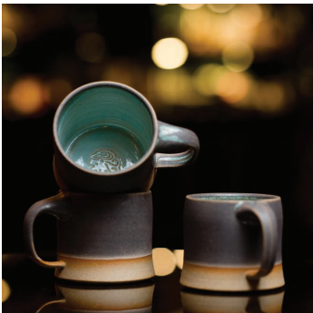
Hand-thrown Lenox Mug Tiffany Hilton Pottery