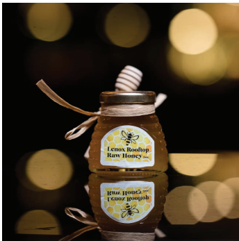
Rooftop Honey The Lenox Hotel