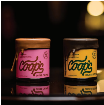
Fudge & Caramel Sauces COOP's Creamery