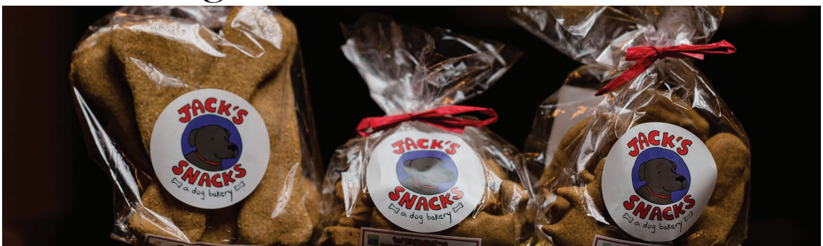
Dog Treats, Jack's Snacks