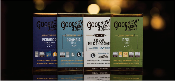
Single Origin Chocolate Goodnow Farms