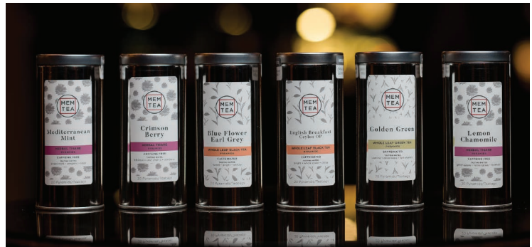
Signature Teas MEM Tea