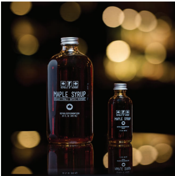
Maple Syrup Republic of Vermont