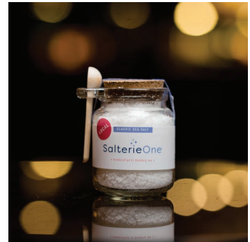
Duxbury Sea Salt Saltery