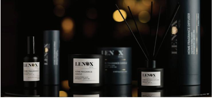
Home Fragrance Collection The Lenox Hotel