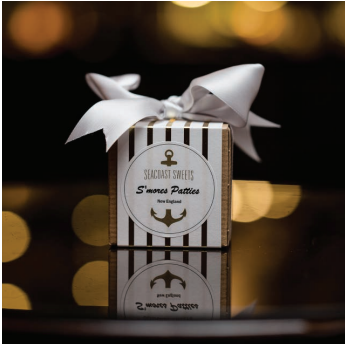
S'Mores Patties Seacoast Sweets