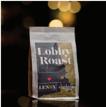
Lobby Roast Coffee Share Coffee Roasters